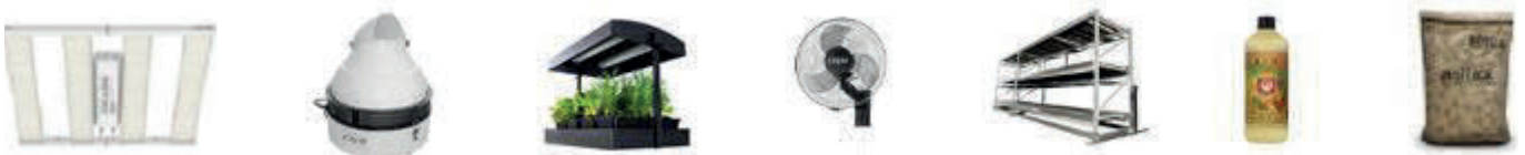
Pictured: PHOTOBIO MX LED, Active Air Commercial Humidifier, SunBlaster LED Grow Light Garden, Active Air Heavy Duty 16" Metal Wall Mount Fan, IGE Grow Racks, House & Garden Bud XL, and Roots Organics Soilless Hydroponic Coco Mix.

Our principal industry opportunity is in the wholesale distribution of CEA equipment and supplies, which generally include nutrients and fertilizers; grow light systems; horticulture benches and racking systems; heating, ventilation, and air conditioning ("HVAC") systems; humidity and carbon dioxide monitors and controllers; water pumps, heaters, chillers, and filters; and various growing media typically made from soil, peat, rock wool or coconut fiber, among others. Today, we believe that a majority of our products are sold for use in CEA applications.